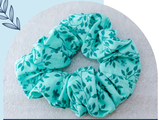
Linen Fabric Floral Green