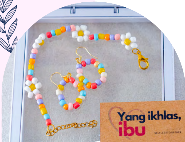
Friendship Daisy RM22