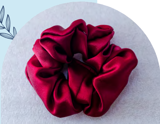
Satin Fabric Radiant Red