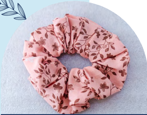
Linen Fabric Floral Coral