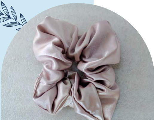
Satin Fabric Classic Gold