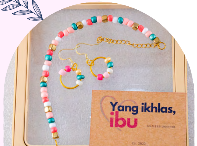
Tic Tac Toe RM22