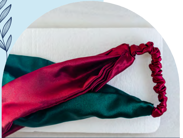
Satin Fabric Classy