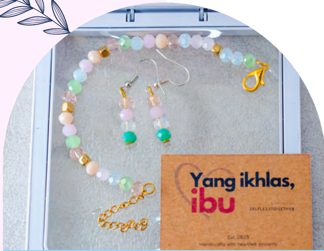
Jade & Pink Elegance RM25