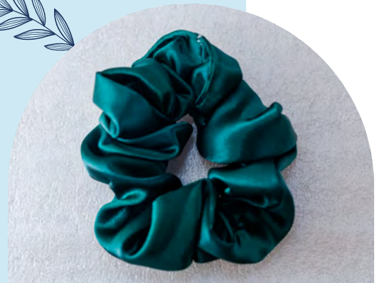
Satin Fabric Sheen Green