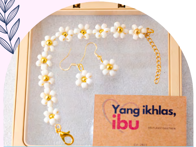
Purity in Petal RM25