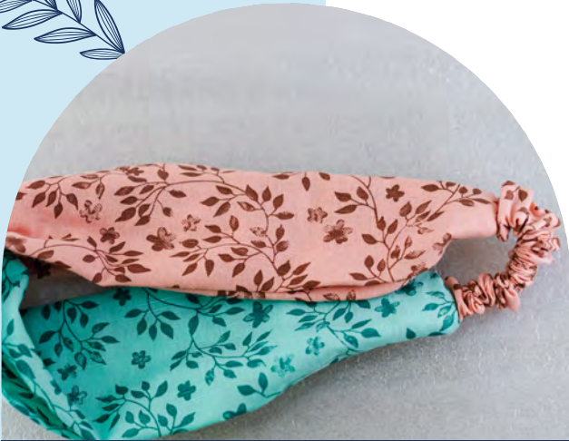
Linen Fabric Floral